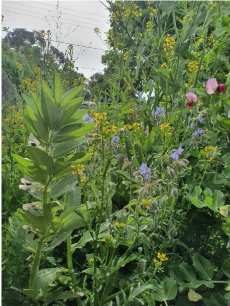
The slugs and snails' favourite buffet of fennel, broad beans, borage and peas

While not quite as popular as the Majura P&C tomato and plant sale, night gardening is on the rise*. While this, yet unstudied, phenomenon may be a product of the pandemic where gardening jobs often take a backseat to home schooling, the demands of little people or watching back to back daily press conferences, it also just makes sense. Being out in the garden after dusk allows for quiet contemplation in the stillness left by the absence of birds and bees. Doing repetitive jobs like pulling weeds, raking leaves or turning compost in the evening can be a calm way to wind down before bed and probably aids in getting a good night sleep*. And all for the price of a head torch. Even inside, it can be a relaxing weekly ritual to wipe down the leaves of