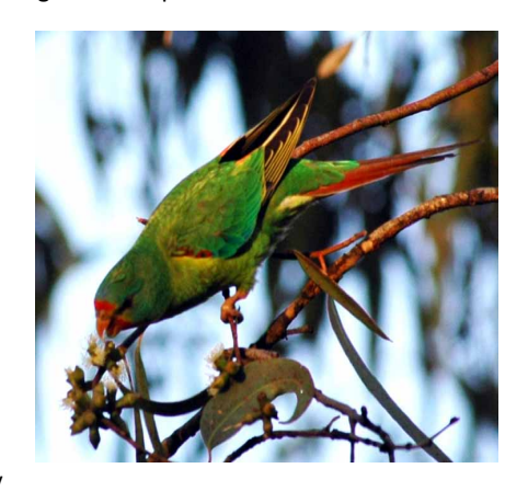
Image: Swift Parrot – Hackett ACT

For more information see Birds in Backyards at http://www.birdsinbackyards.net/species/.