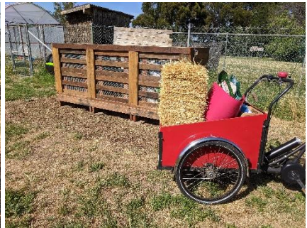
Composting information session at YWAM Community Garden